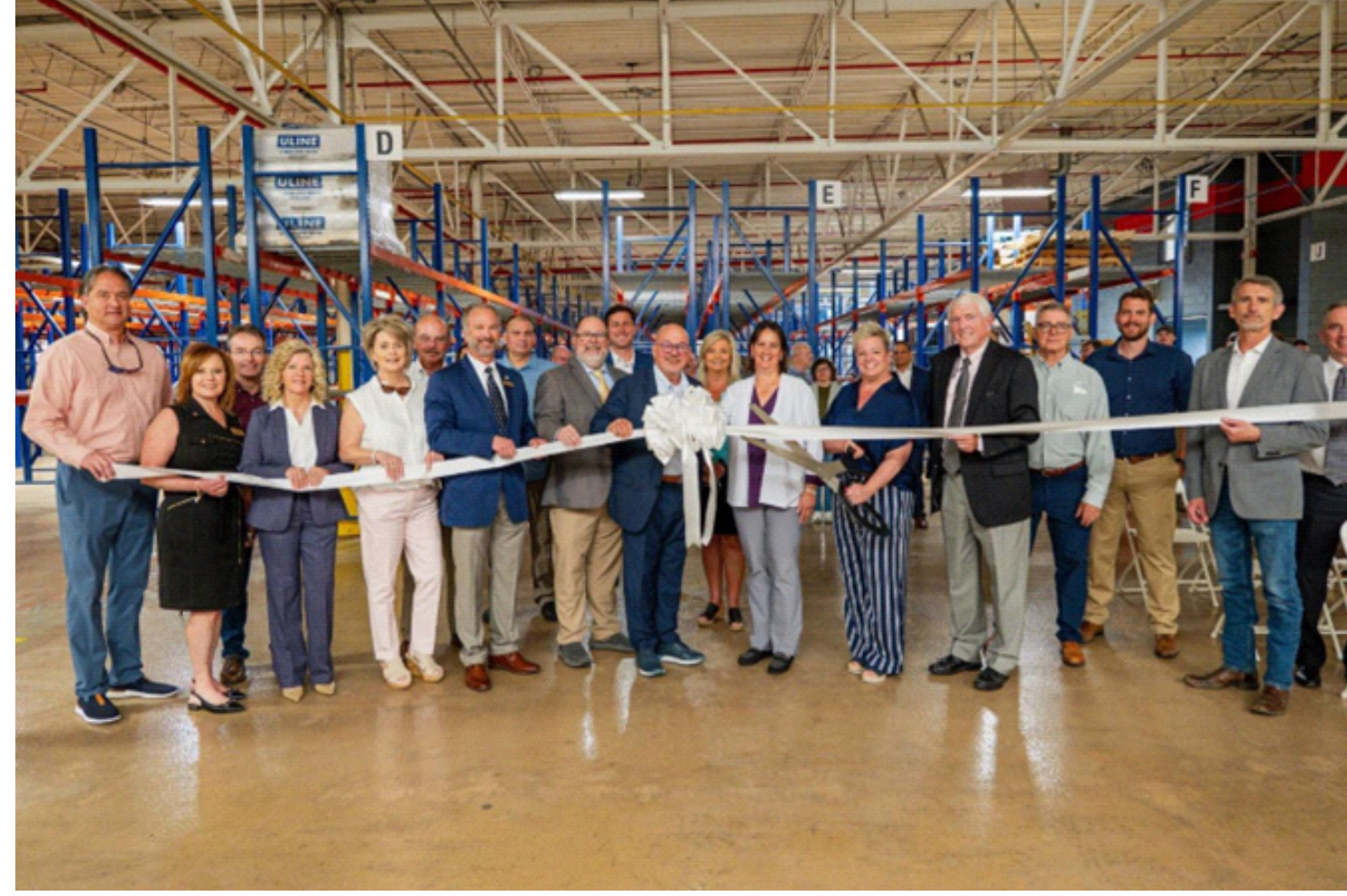
TDEC Commissioner David Salyers, center, leads a ribbon-cutting for the completion of the state's first remediation project under the Brownfield Redevelopment Area Grant (BRAG) program.

BRAG grants are derived from Gov. Bill Lee's Rural Brownfield Redevelopment Investment Act, which protects the environment and creates economic opportunities, especially in rural settings. The legislation empowers local governments and development